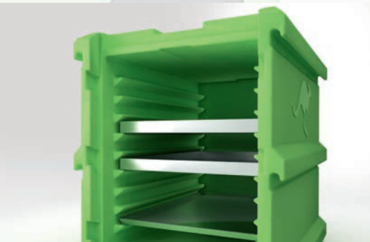
Choice of 6 or 10 insert grooves