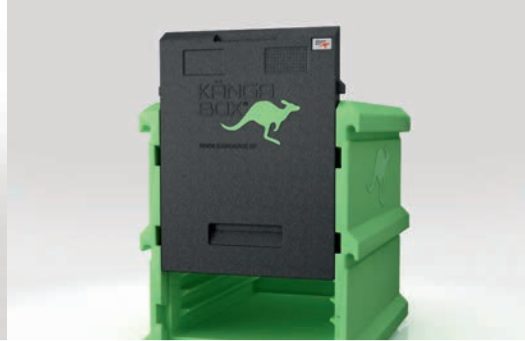
Removable sliding door for easy access