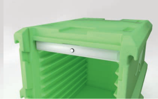
Insert groove for hot and cool packs