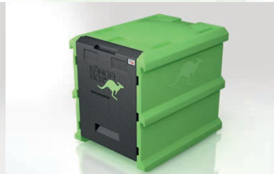
Manufactured in one piece for stability and a long service life