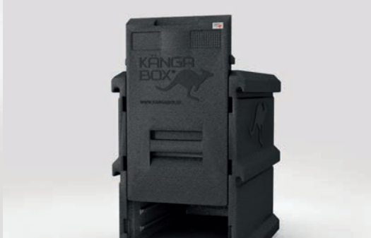
Removable sliding door for easy access