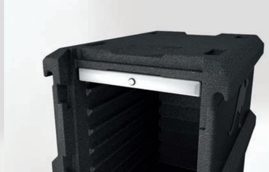
Insert grooves for hot and cool packs