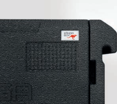
Tightly-sealing door – no smells