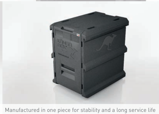
Manufactured in one piece for stability and a long service life