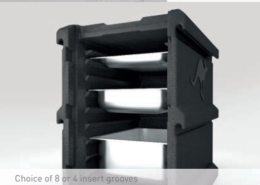
Choice of 8 or 4 insert grooves