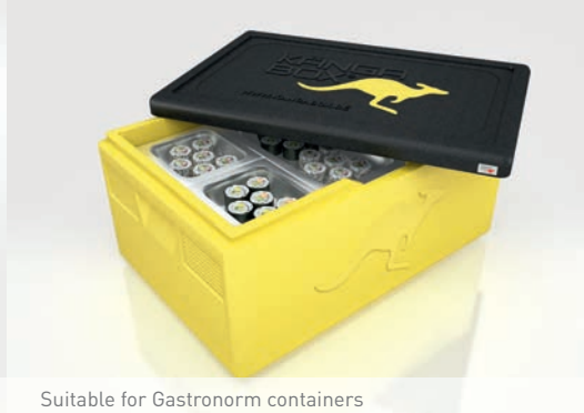
Suitable for Gastronorm containers