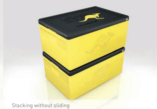
Stacking without sliding