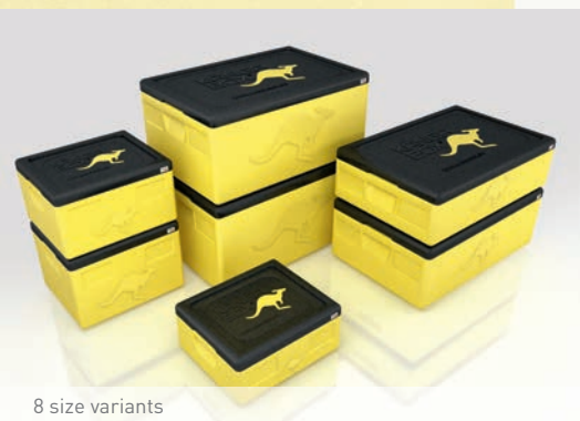
8 size variants