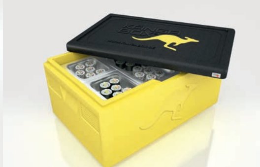
Suitable for Gastronorm containers