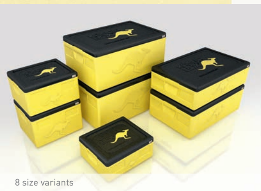
8 size variants