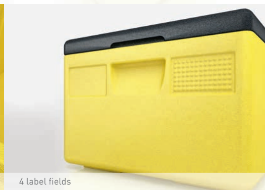
4 label fields