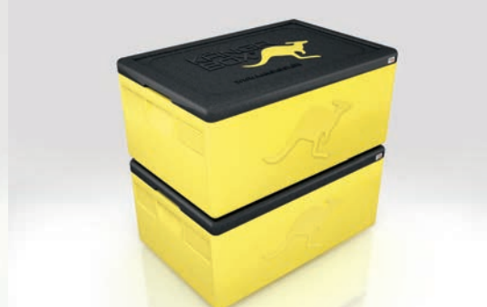
Stacking without sliding