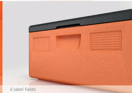
4 label fields