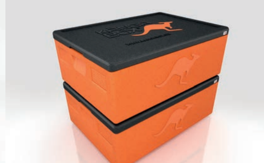
Stacking without sliding