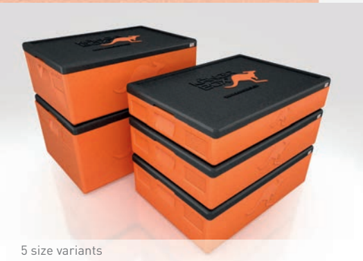
5 size variants