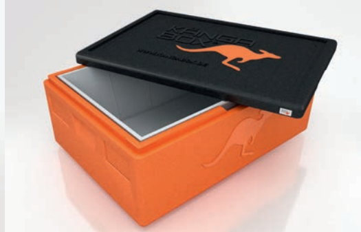
Fits 60x40 cm boxes or trays