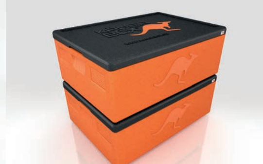
Stacking without sliding