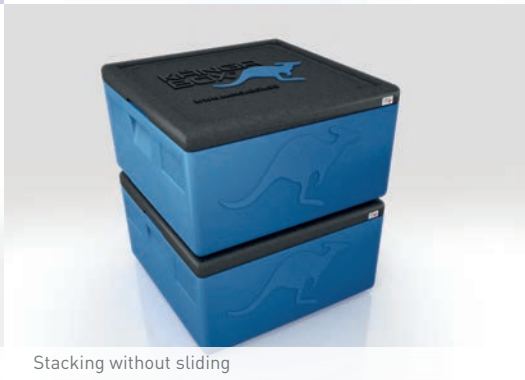
Stacking without sliding